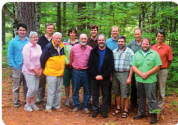
Au Sable staff and board